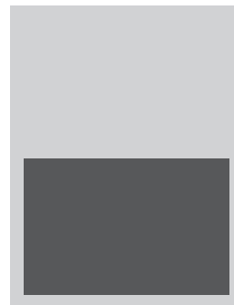
1/2 pg. horiz. (7.375" x 4.875")